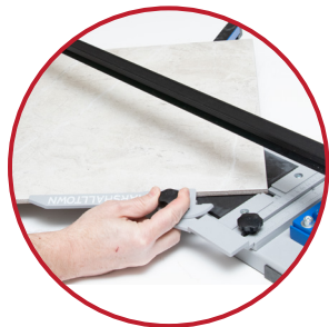
Protractor Gauge for precise angled cuts