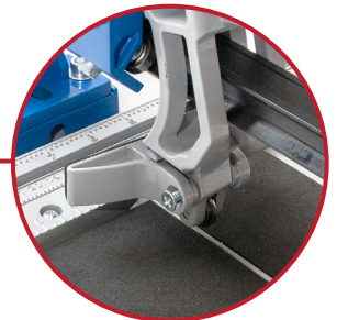
Magnet to hold Breaker Foot up