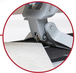
Tungsten Carbide Cutting Wheel