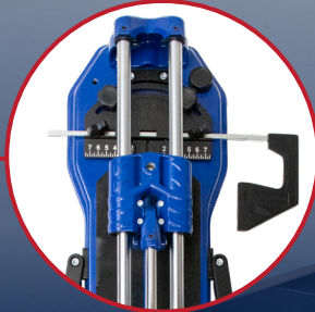
Durable Two-Rod Rail System