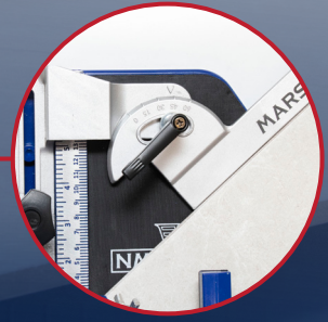
Protractor Gauge for precise angled cuts