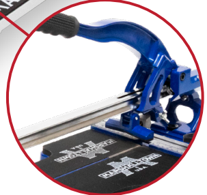
Rigid Steel Monorail Sliding System