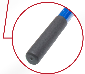
Rubber Grip Handle