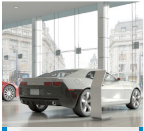
Floors installed with Mapetex System